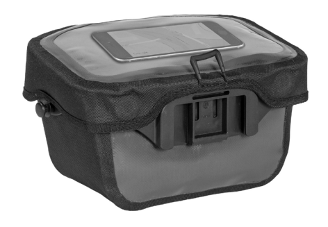
Smartphone in transparent lid compartment (not included)