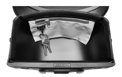
Carabiner with key chain

Handlebar mounting-set (sold separately):