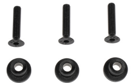
QL3.1 studs (incl.)