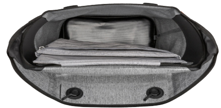
Interior view with laptop compartment