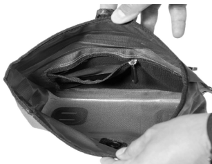
Inner pocket with zip