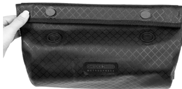
Fixation of the roll closure via two magnets