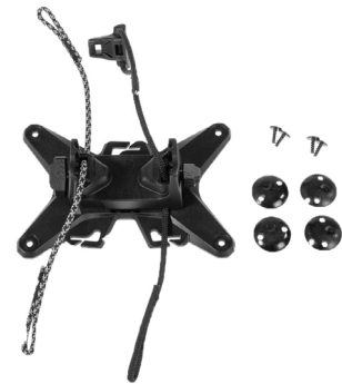
Optional application with Bar-Lock mounting set possible (not included in the scope of delivery)