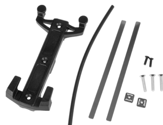
Quick-Lock S adapter plate incl. mounting accessories (included in delivery)