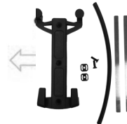
Quick-Lock S adapter system for suspension forks