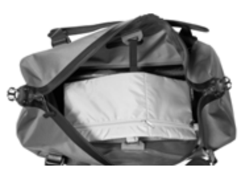
New, removable inner pocket protects contents from getting caught in the zipper

Reflector symbol on the bottom of the bag