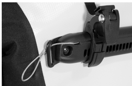
Anti-theft device mounted inside QL2.1 rail

Flexible anti-corrosive steel wire with loop for cable or U-lock