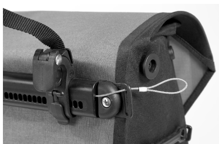
Anti-theft device mounted to QL2 pannier